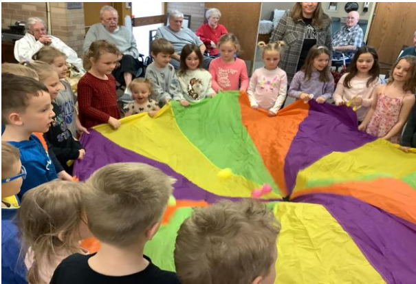
HBC Kindergarten Class with residents

Contact Jocelyn for questions at 507-962-3275 ext. #4