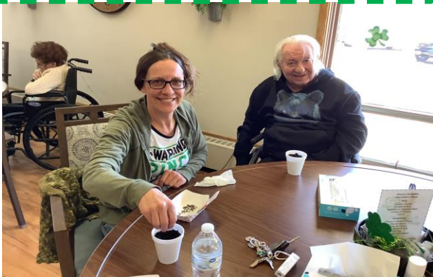
Resident and daughter planting seeds.