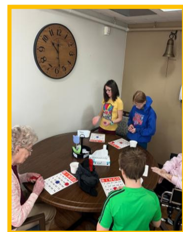
HBC 5 th Grade Class playing Bingo with residents.